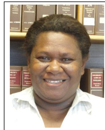
Commissioner Emmanuella Kauhue