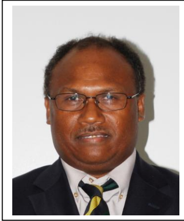
Commissioner Gabriel Suri