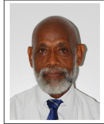
Commissioner Waeta Ben Tabusasi