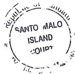
Justice Sam Vula

Dated long sarete Village long 19 th July 2010