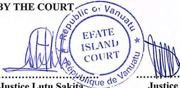
..... Justice Lutu Sakita (Presiding Justice)